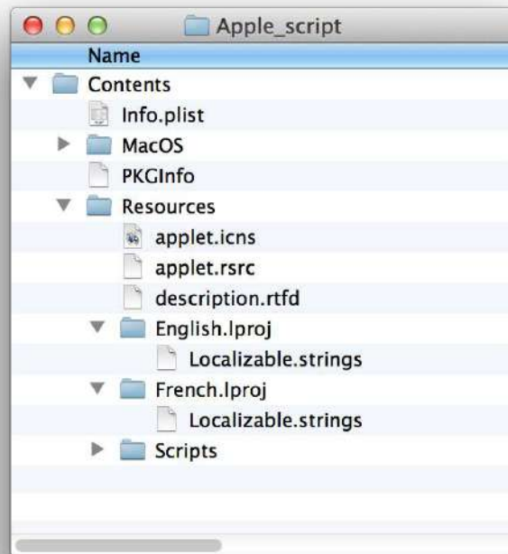
Figure 7-1 Bundle structure with localized string data