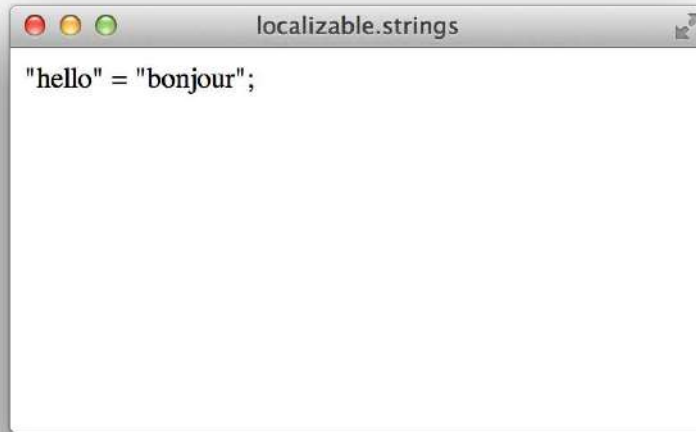
Figure 7-2 Key/value pair for localized string data

Now localized string will return the appropriate values, as defined in your files. For example, when running in French: