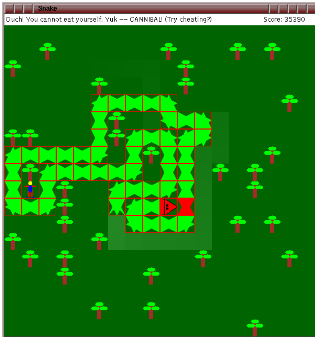
Figure 1: A screen dump of a game. The optional extra feature of a gutter trail is visible behind the snake.